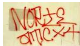
Norteño graffiti in red paint with X4 (14).

Tagger crews, Straight Edge, Insane Clown Posse/Juggalos