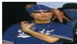
Using a blue Dodgers jersey and bandana to represent the Crips.