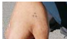
3 dots - often with 1 dot on the other hand - to symbolize "13".