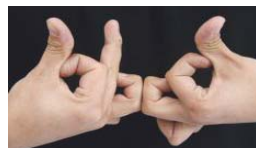
Hand sign spelling the word "blood".